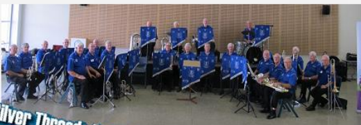
The Silver Threads Band